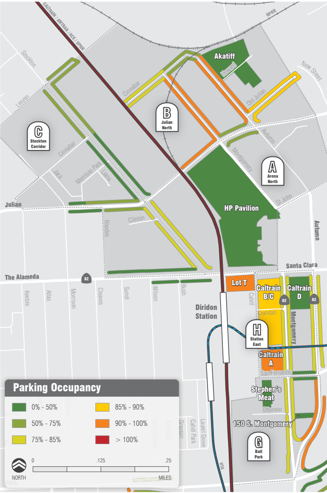
Figure 2A Parking Utilization - Non-Event 7:00-9:00 AM (Subareas A, B, C, G, H)