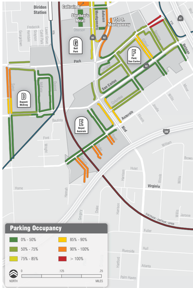
Figure 2C Parking Utilization - Non-Event 7:00-9:00 AM (Subareas D, E, F, G)