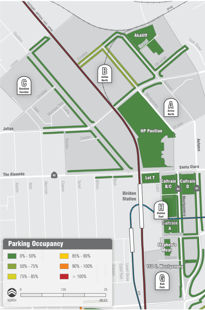
Figure 3A Parking Utilization - Non-Event 5:00-9:00 PM (Subareas A, B, C, G, H)