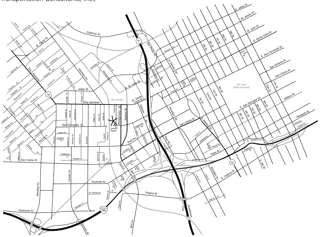
Figure 5-1: EXISTING ROADWAY NETWORK

An evaluation of existing traffic conditions was conducted for the Diridon Station Area with the purpose of identifying roadway capacity restrictions for future development. The analysis includes the evaluation of existing level of service conditions at intersections and freeway segments within and surrounding the Diridon Station Area. The evaluation begins by identifying intersections and freeway segments that serve as major gateways to the Diridon Station area and major intersections within the area. The existing transportation system surrounding the Diridon Station is shown in Figure 1. Existing conditions for bicycle and pedestrian facilities were also included. Existing intersection and freeway level of service conditions are listed at the end of the chapter.