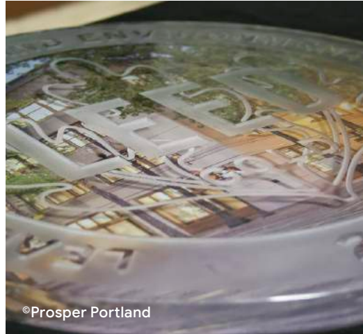
LEED GOLD CERTIFICATION

The following standards and guidelines document sustainability commitments through AB900.