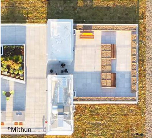
HIGH ALBEDO ROOFS