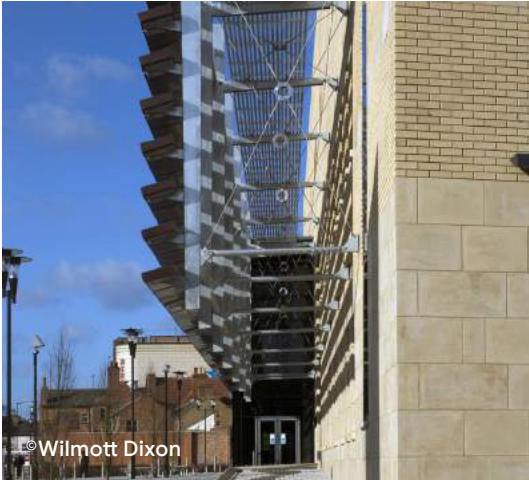
PERFORMATIVE FACADE SYSTEMS

Standards and guidelines related to sustainable building design are referenced on the facing page. For more information, see Chapter 5: Buildings .