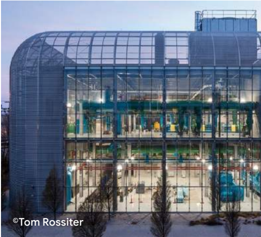
CENTRAL UTILITY PLANT - EXTERIOR

For more information, see Downtown West District Infrastructure Plan.