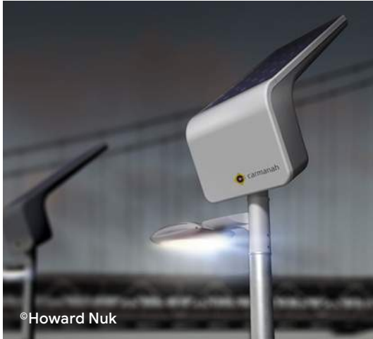
ENERGY EFFICIENT LIGHTING FIXTURES