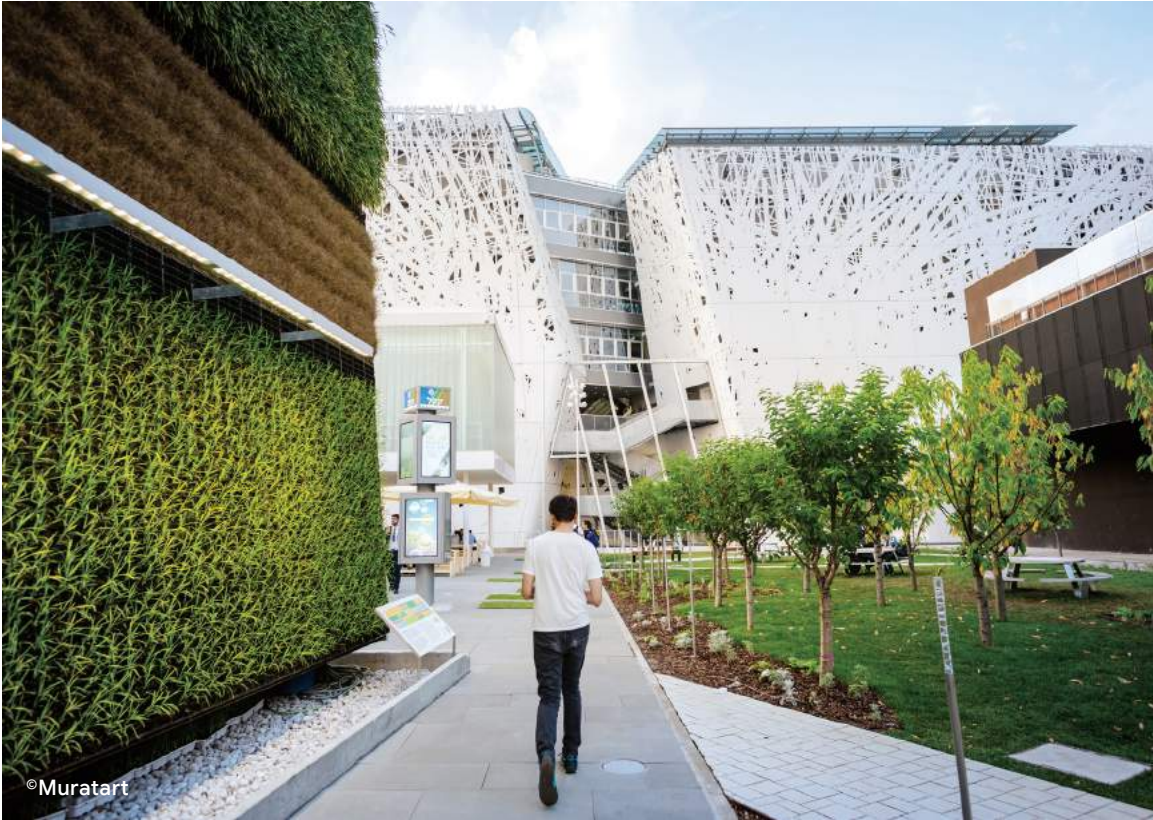
FIGURE 7.1: Illustrative examples of sustainable design strategies

A subsequent Downtown West District Sustainability Plan will be created following the approval of the Project.