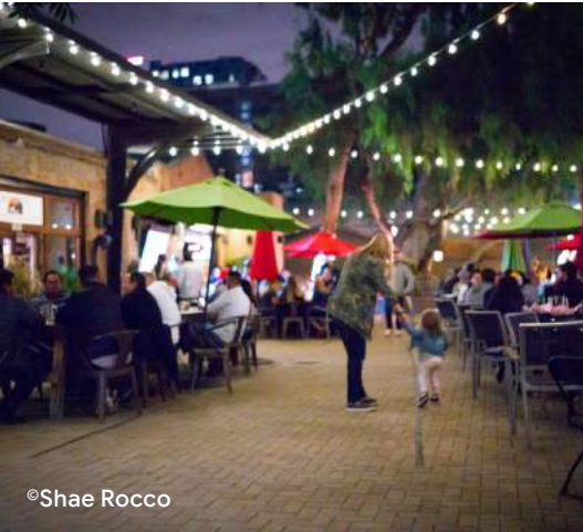
DARK-SKY SENSITIVE OPEN SPACE LIGHTS

Lighting in the public realm and buildings within and adjacent to ecologically sensitive zones is designed to minimize the disturbance to natural habitat and promote “dark sky” benefits for circadian rhythms and star visibility. Lighting is designed and sited to avoid spill and glare, and to be consistent with public safety considerations. Lighting is shielded and directed away from the creek and the riparian corridor. Standards and guidelines related to sustainable lighting strategies are referenced on the facing page. For more information, see Chapter 8: Lighting and Signage .