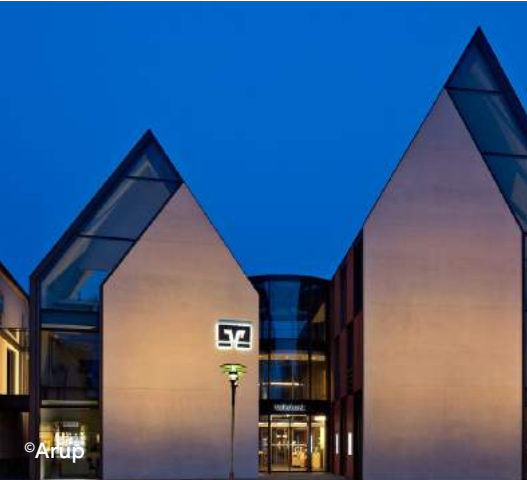
SUBTLE BUILDING LIGHTS