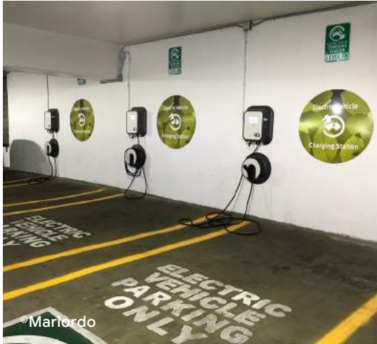
EV CHARGING STATIONS