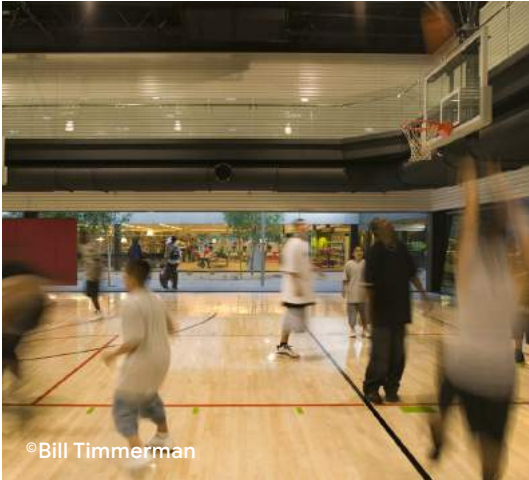
HEAT REFUGE AREAS