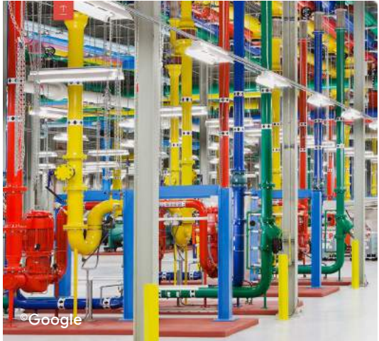
CENTRAL UTILITY PLANT - INTERIOR