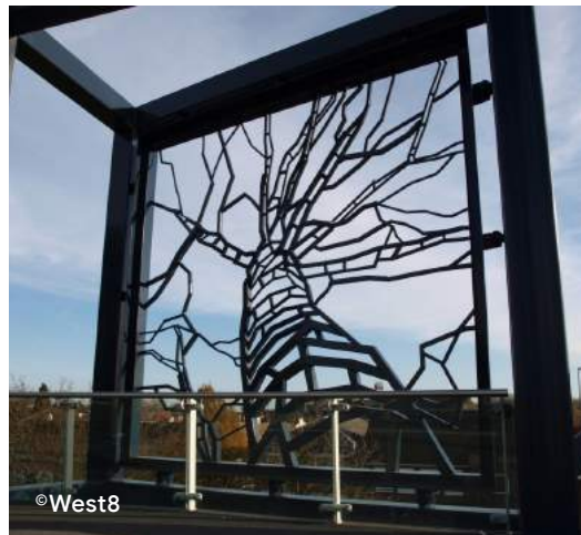
INTERPRETIVE PUBLIC ART