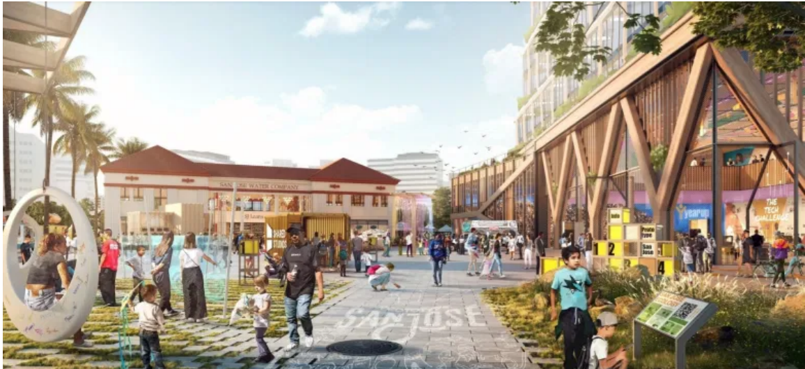
Gateway section near Water Company Building within Google's Downtown West transit-oriented neighborhood in downtown San Jose, concept. // SITELAB urban studio, Google

Google has proposed the development of a transit-oriented neighborhood near the Diridon train station and SAP Center that would include office buildings, homes, shops, restaurants, activity hubs, cultural centers, hotel facilities, and open spaces.