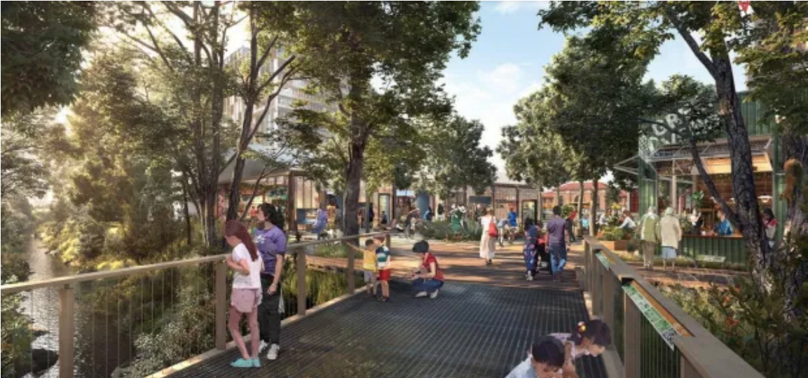
Creek bridge and nature areas near Diridon train station in Google's Downtown West project in downtown San Jose, concept. SITELAB urban studio, Google

The tech titan says that it hopes to break ground on the first new buildings in 2023 and that it is aiming to launch construction of streets and other crucial infrastructure in 2022 if the city approves a project that will reshape a wide section of downtown.