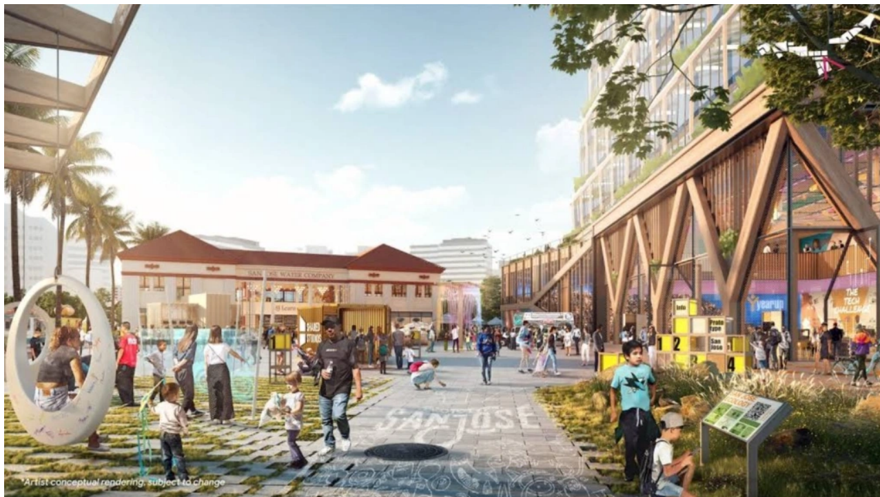
Concept drawing of gateway area of Google's Downtown West development in San Jose.

One question that will come to define the cities of tomorrow: Do you want to be there, or do you have to be there?