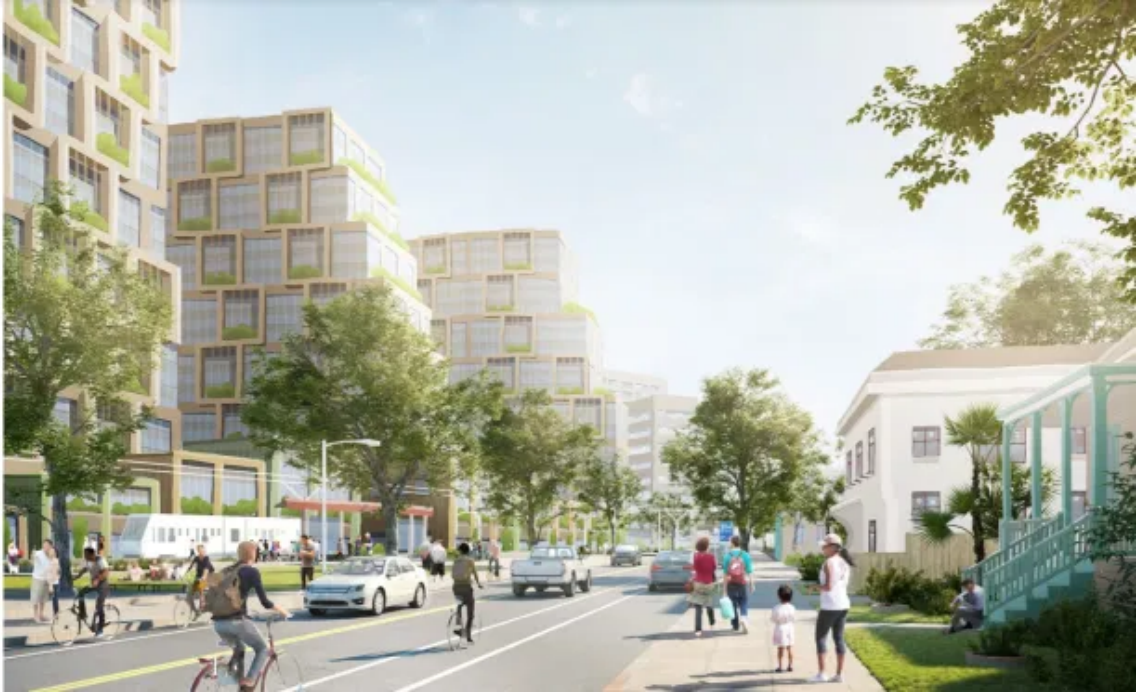
San Fernando Street area of Google's proposed Downtown West transit-oriented neighborhood in downtown San Jose, showing buildings in the project near a light rail line and existing building, concept.