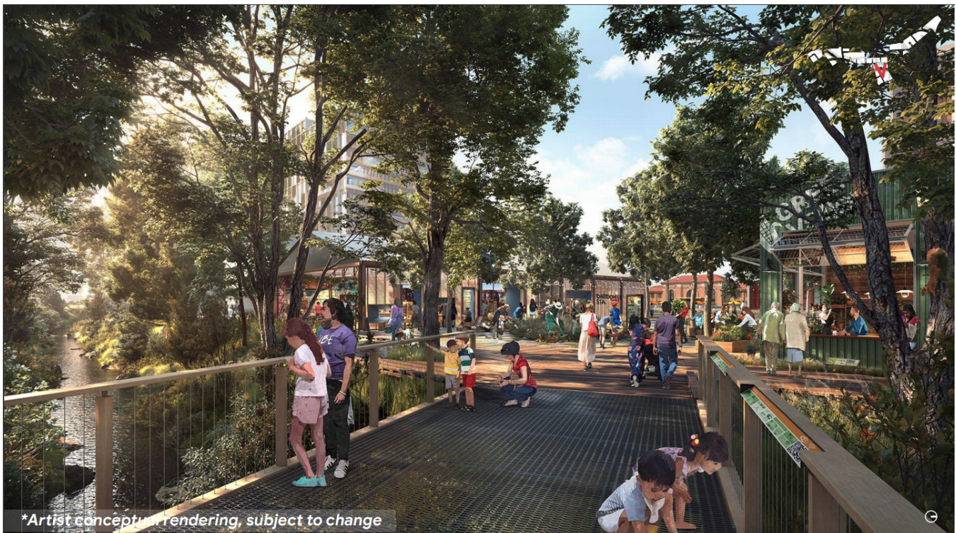
*Artist conceptual rendering, subject to change