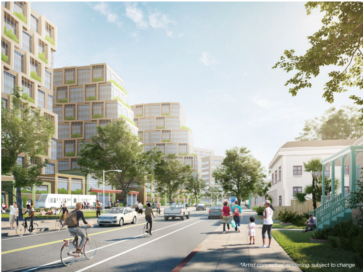
A rendering of Google's Downtown West development along San Fernando.

“This makes San Jose a national model for how we can rebuild equitably after this pandemic as cities throughout the country will be struggling mightily to address epic levels of unemployment and dislocation in their communities,” he told San Jose Inside. “San Jose is finding the path through this partnership and one that will pay benefits to our surrounding community for many years to come.”