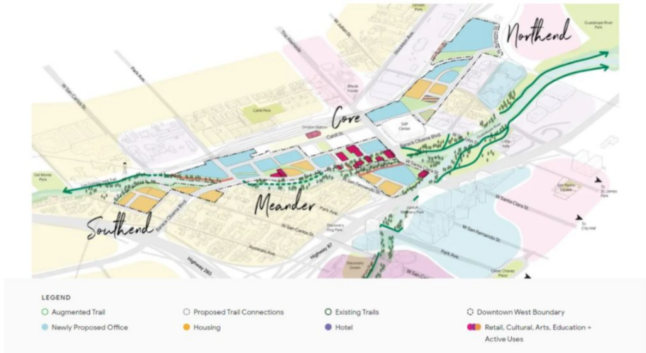
A look at Google's proposed land uses for its massive development in downtown San Jose.

"Google didn't just listen and nod their head and get paid," Staedler said of the community benefits plan. "They actually made changes to the plan. ... It's a win-win."