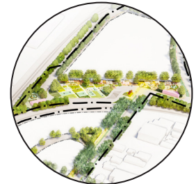
① Northend Park