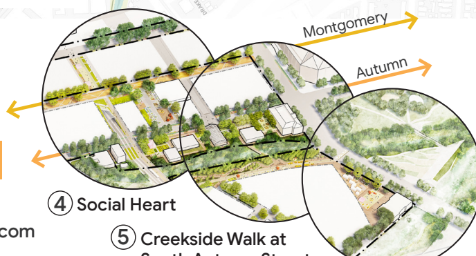
④ Social Heart