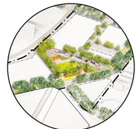
③ St. John Triangle