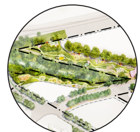
⑨ Los Gatos Creek Park