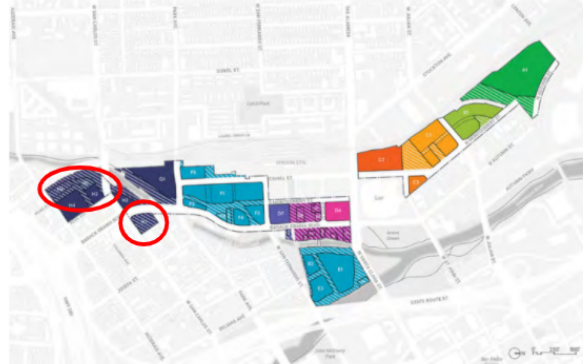
FIGURE 5.12: Illustrative maximum height per block above current ground level

For heights adjacent to historic resources refer to Section 5.15. Refer to DDG Section 4.4.7a for information on rooftop appearances and mechanical equipment.