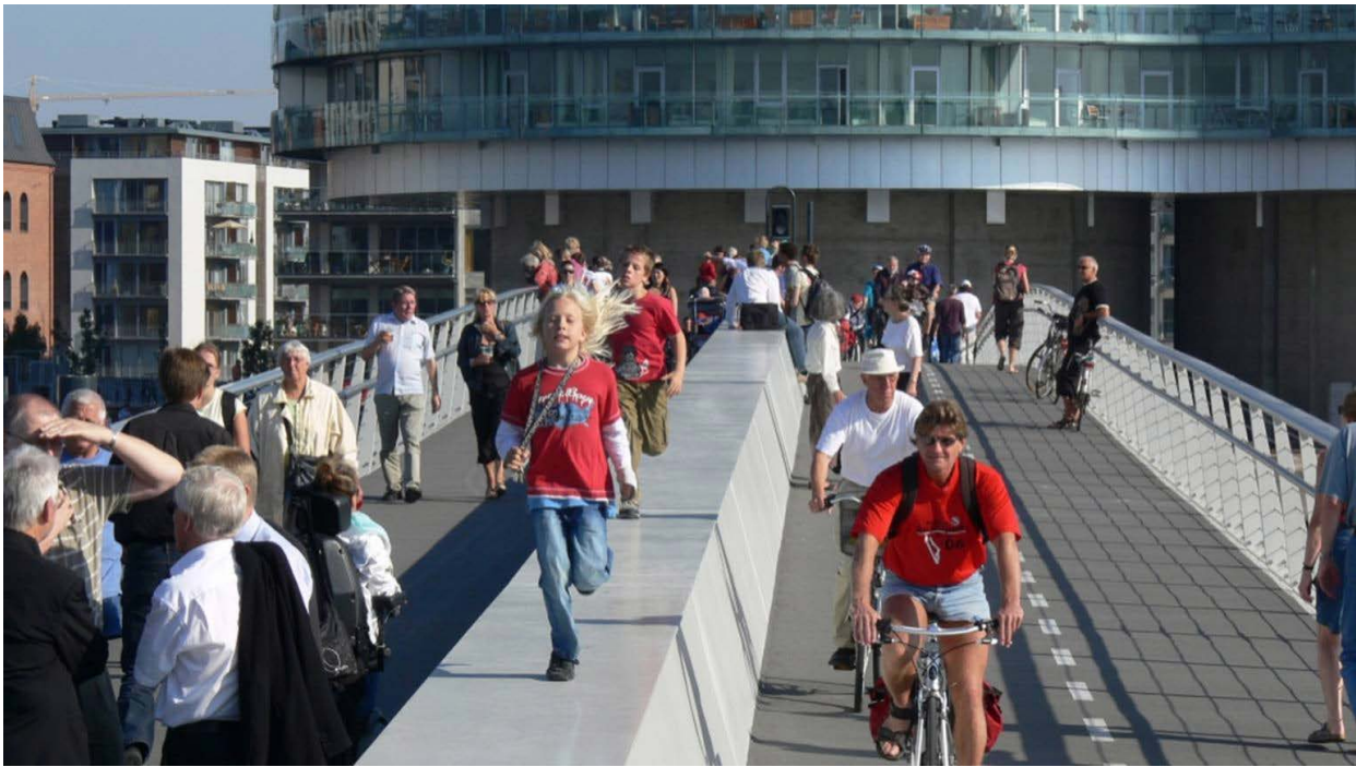
The Creek Arch in Copenhagen (image 1 of )