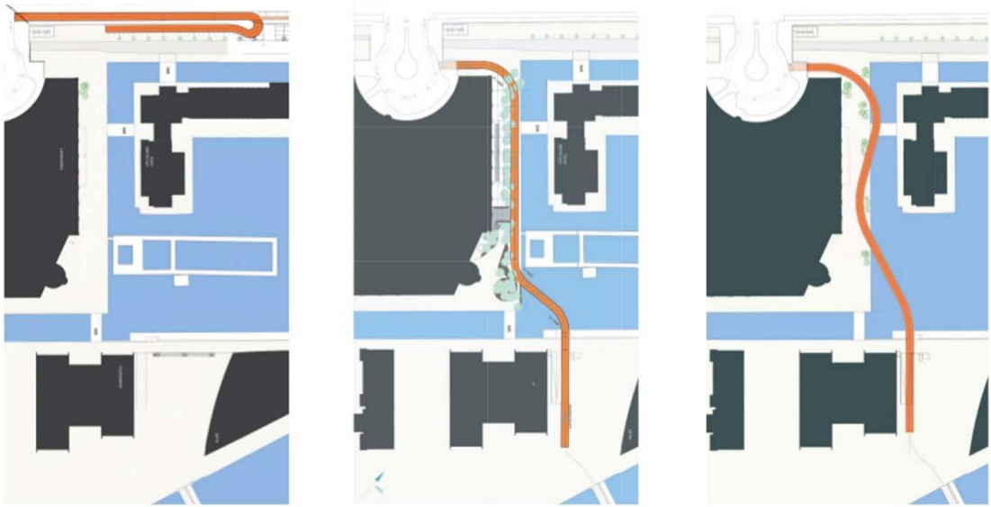
Quay Bridge in action