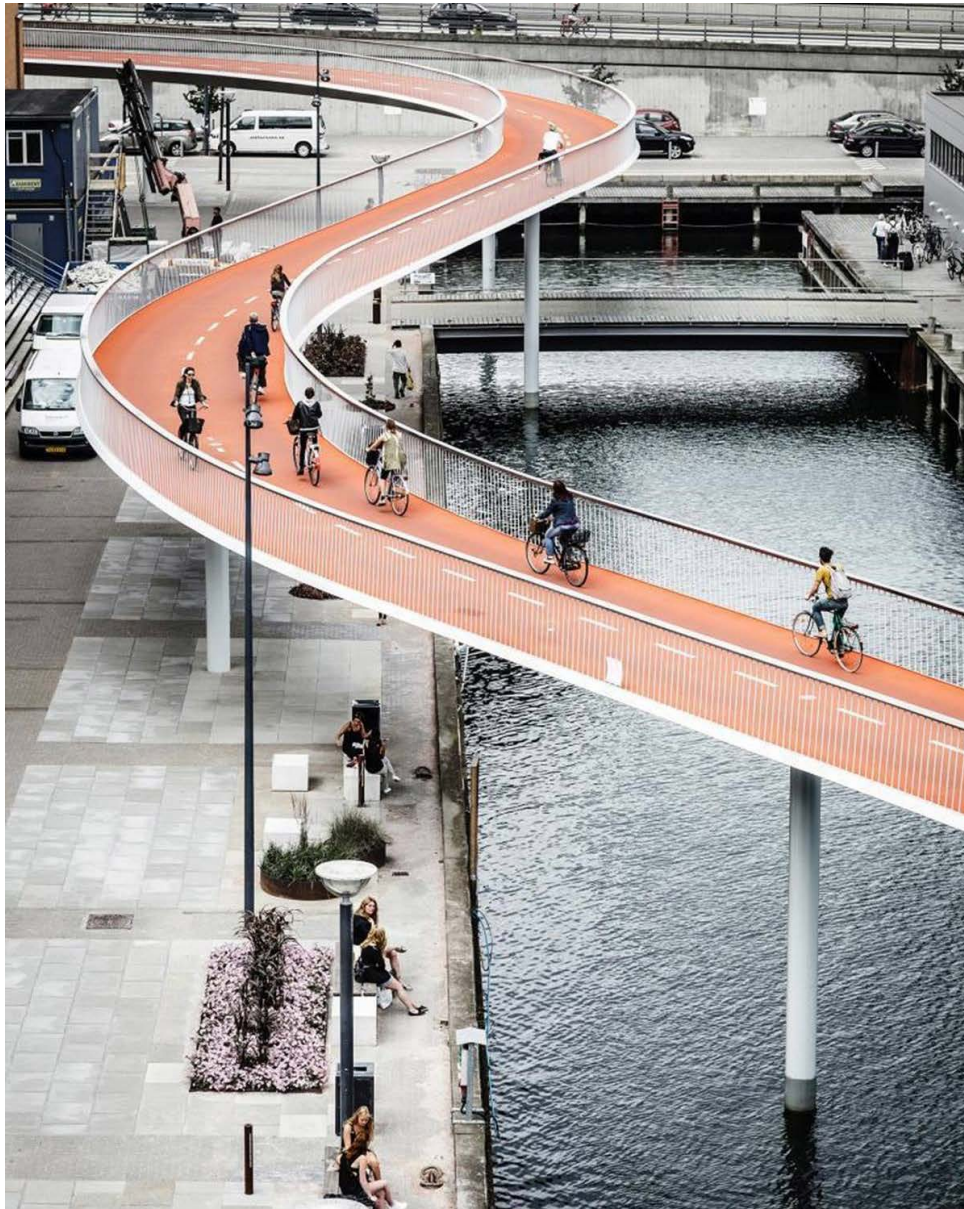
Snake Bridge with the Quay Bridge also shown (together, they make the network work) (image 2 of 3)

Snake Bridge in Copenhagen (image 1 of 3)