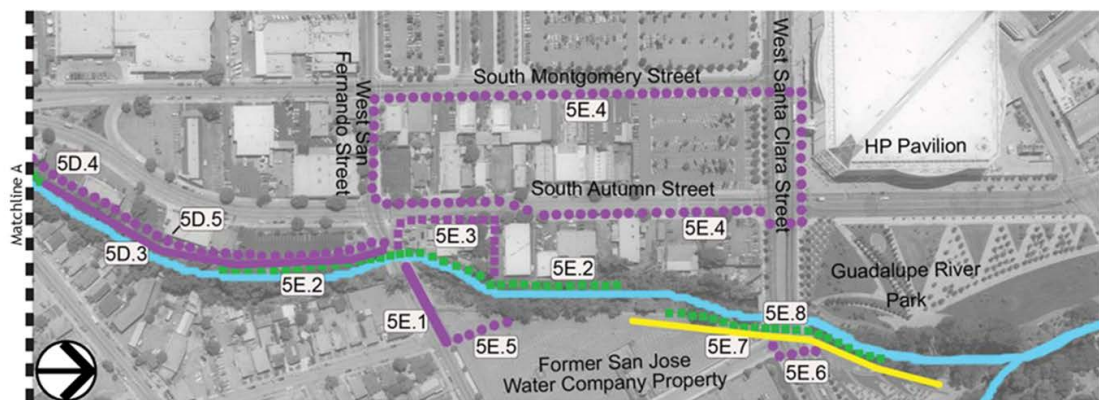
Figure 12B: Alternative Alignments Plan, See Figure 12A for Legend

© copyrighted 2008 Callander Associates Landscape Architecture, Inc.