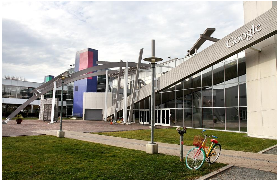
Google's main campus in North Bayshore.

Mountain View's vision for North Bayshore is banking on a car-lite future for the city's bustling jobs center, home to massive tech offices for Google, Microsoft and Intuit. But when it comes to getting commuters to bike to work, the city is missing the mark and losing ground.