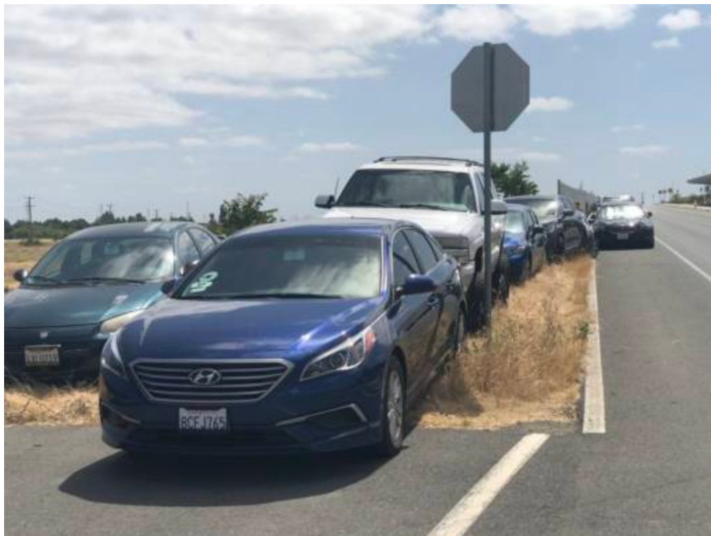
Cars parked on a roadside just outside Antioch's new BART station.

By all accounts, people in eastern Contra Costa County love the brand-new eBART line from Pittsburg-Bay Point to Antioch. In its first week of operation, the service has far exceeded its projected ridership.