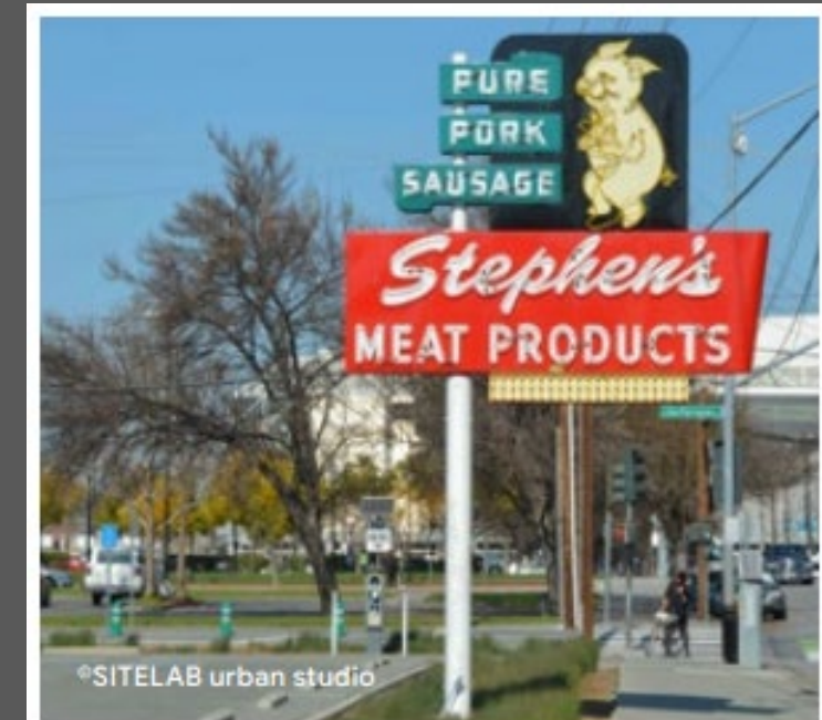
FIGURE 5.48: Stephen's Meat Products sign

White = Significant but Mitigable Impact