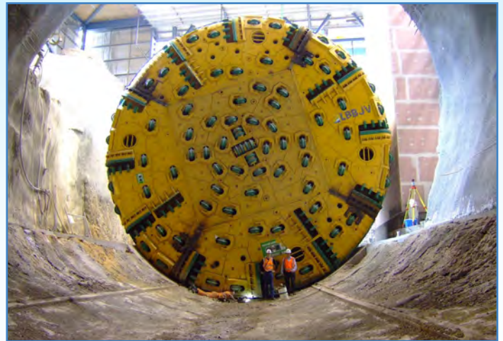
Example of a tunnel boring machine