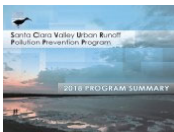
2018 Program Summary

The Program is organized, coordinated, and implemented in accordance with a Memorandum of Agreement (MOA) resigned by the member agencies in 2016. The MOA covers the responsibilities of each member