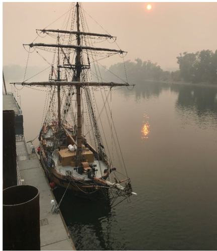
Poor air quality envelops the Sacramento region as shown in this picture of the Tower Bridge dock on the Sacramento River. Photo taken at 3:30PM on November 15, 2018.

The Camp Fire impacted air quality in surrounding regions as smoke spread across the Central Valley. The Sacramento Metropolitan Air Quality Management District recorded 13 consecutive unhealthy Spare-the-Air days. Air quality readings of PM 2.5 levels reached a peak of 314 for the 24-hour period of Thursday, November 15, 2018, the second highest since 2003. Readings of PM 2.5 across multiple areas of Sacramento topped 400 in the overnight hours due to low inversion layers, light winds, and cool temperatures.